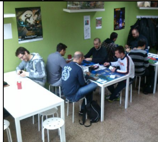
29. El Nucli 30. InGenio 31. Maná Infinito

MAGIC The Gathering GRANDPRIX BARCELONA 2014